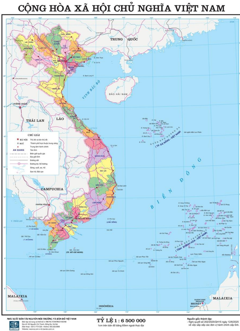
Figure 1: Map of Việt Nam with 34 Provinces

The reform’s objectives are both practical and political. Practically, it seeks to rationalize administrative boundaries, strengthen fiscal sustainability, and ensure more uniform public service provision. Politically, it reflects a long-term vision of establishing a leaner two-tier governance model, in which intermediate administrative layers are reduced, and local units are larger, stronger, and more capable. The most recent and far-reaching reform, enacted via Resolution 202/2025/QH15 by the National Assembly on June 12, 2025, restructured provincial-level units from 63 to 34, merging 52 units into 23 new ones while 11 remained unchanged, resulting in 28 provinces and 6 centrally-run cities (National Assembly 2025b; see also figure 1). A key change was the transition from a three-tier (provincial, district, ward/commune) to a two-tier (provincial, ward/commune) system, abolishing approximately 696 district-level units effective July 1, 2025 (National Assembly 2025a; Nguyễn et al. 2022).